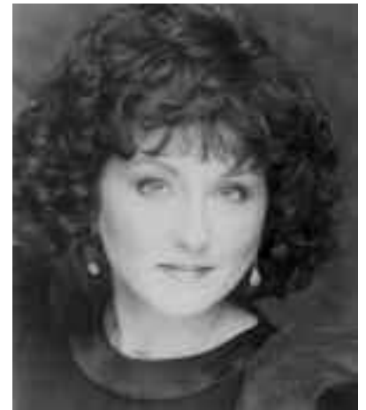
Royal College of Music and speak at the Royal Opera House Covent Garden. ■